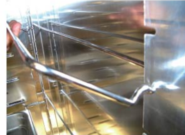
GRASP THE RUNNER AS SHOWN IN THE PHOTOS BELOW.

RUNNERS MUST BE REMOVED WITH A 4" MINIMUM SPACE ABOVE THEM TO REMOVE A RUNNER