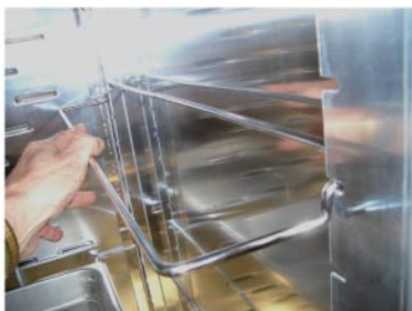
WHEN IN THE CORRECT POSITION THE RUNNER WILL BE AT 90 DEGREES TO THE SIDE OF THE CABINET.

RUNNERS MUST BE REMOVED WITH A 4" MINIMUM SPACE ABOVE THEM TO REMOVE A RUNNER