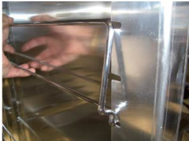
TILT THE RUNNER UP AND ENGAGE BOTH ENDS TOGETHER. DO NOT HAVE ONE SIDE ENGAGED LESS THAN THE OTHER.