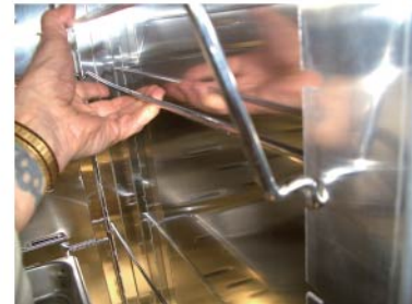
TILT THE RUNNER UP SLOWLY WHILE PULLING THE RUNNER OUTWARD AWAY FROM THE SIDE OF THE CABINET. DO NOT FORCE IT. ASSURE BOTH SIDES ARE IN THE SAME POSITION AS YOU ARE LIFTING THE RUNNER.