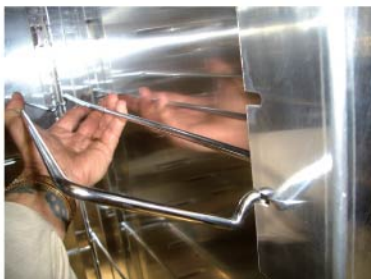
ROTATE THE RUNNER DOWN APPLYING A SLIGHT FORCE INWARD AGAINST THE RUNNER AND CABINET. DO NOT FORCE IT.