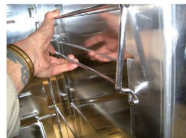
KEEP TILTING UNTIL THE RUNNER TOUCHES THE SLOTTED SIDE OF THE CABINET AND WITH BOTH ENDS OF THE RUNNER EQUAL DISTANT FROM THE CABINET SIDE. THE RUNNER WILL SLIDE OUT EASILY. DO NOT FORCE IT.