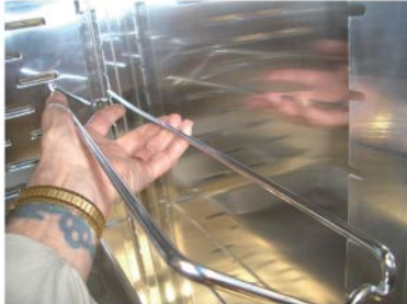
GRASP THE RUNNER AS SHOWN IN THE PHOTOS.

RUNNERS MUST BE ASSEMBLED WITH A 4" MINIMUM SPACE ABOVE TO ASSEMBLE THE RUNNER