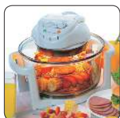
Secura Turbo Oven 777MH & 798DH